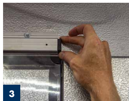
3 Secure strips with end caps