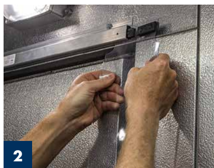
2 Slide in strips