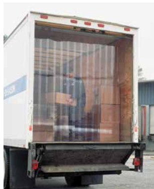
RIGHT: Optional doorjamb or side wall mount with supplied header brackets.