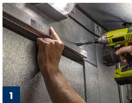
1 Attach mounting bar